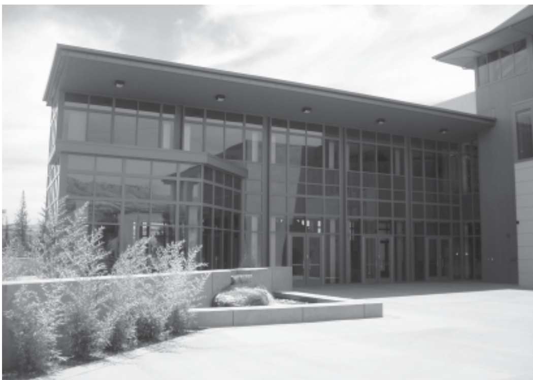
The Library/Educational Technology Center

The San Jose/Evergreen Community College District is a participant and sponsor of the South Bay Regional Public Safety Training Consortium. This Consortium is a joint powers agency created by local community colleges to present certified courses associated with public safety. These include Law Enforcement, Reserves, Corrections, Probation, Fire Technology, Emergency Medical Services, Hazardous Materials, and Dispatch. The intent is to enhance the campus-based degree and certificate programs, giving students the option to go directly into Academy-type skill development training presented through the Central Consortium. Telephone (408) 270-6458.