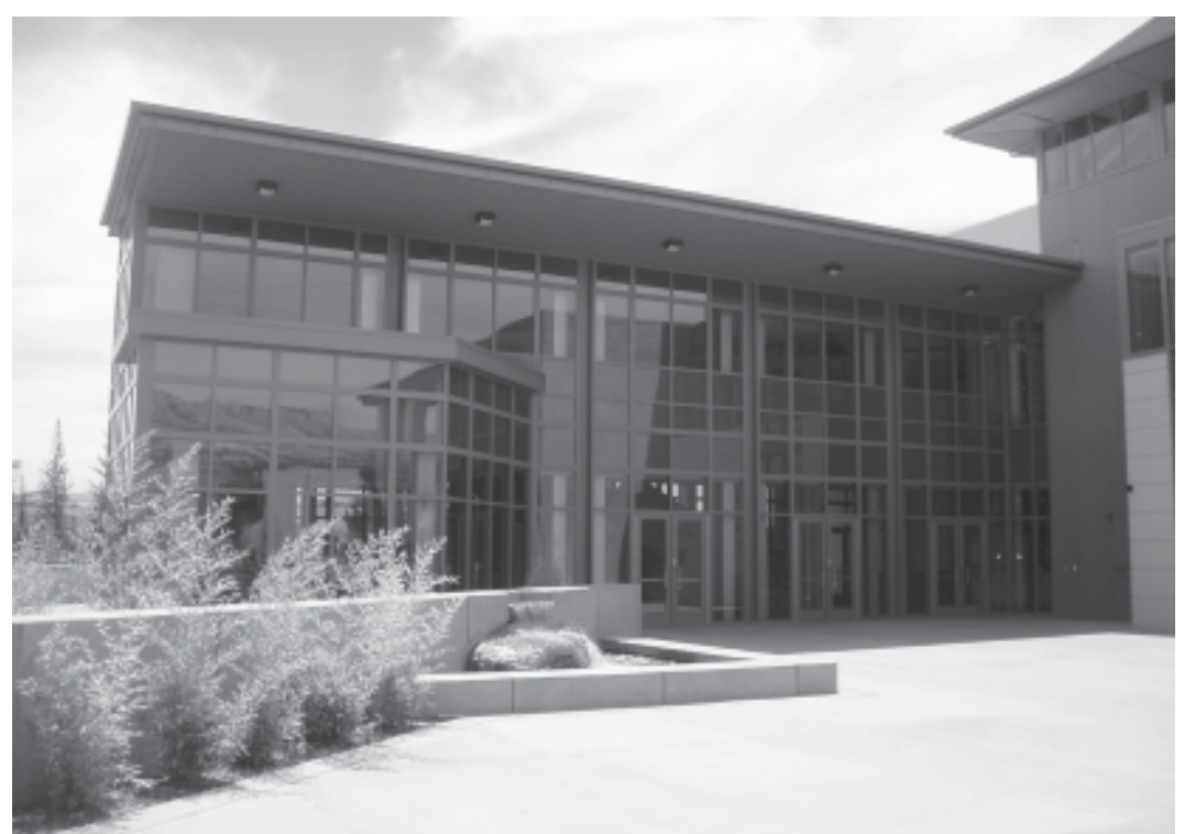
The Library/Educational Technology Center

The San Jose/Evergreen Community College District is a participant and sponsor of the South Bay Regional Public Safety Training Consortium. This Consortium is a joint powers agency created by local community colleges to present certified courses associated with public safety. These include Law Enforcement, Reserves, Corrections, Probation, Fire Technology, Emergency Medical Services, Hazardous Materials, and Dispatch. The intent is to enhance the campus-based degree and certificate programs, giving students the option to go directly into Academy-type skill development training presented through the Central Consortium. Telephone (408) 270-6458.