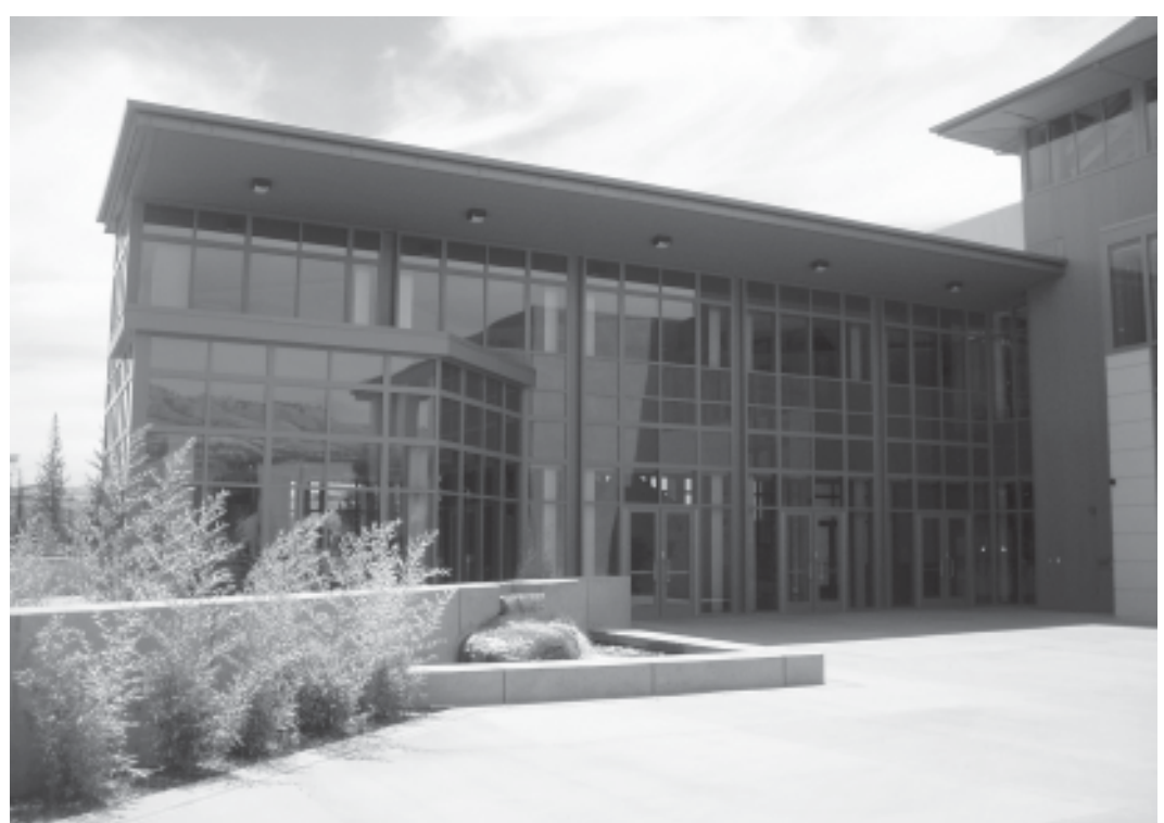
The new Library/Educational Technology Center, also shown on pg. 1

The San Jose/Evergreen Community College District is a participant and sponsor of the South Bay Regional Public Safety Training Consortium. This Consortium is a joint powers agency created by local community colleges to present certified courses associated with public safety. These include Law Enforcement, Reserves, Corrections, Probation, Fire Technology, Emergency Medical Services, Hazardous Materials, and Dispatch. The intent is to enhance the campus-based degree and certificate programs, giving students the option to go directly into Academy-type skill development training presented through the Central Consortium. Telephone (408) 270-6458.