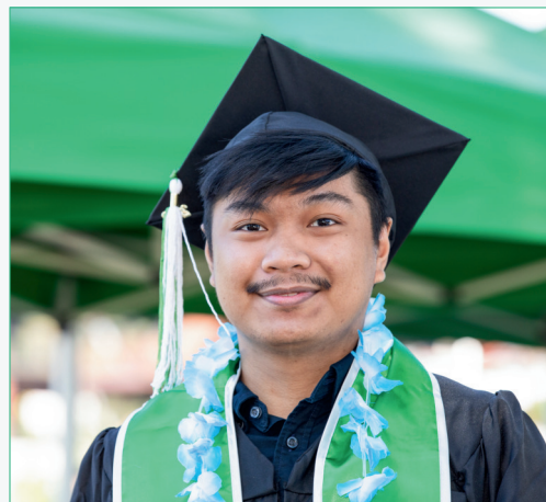
EVC GRAD 2024