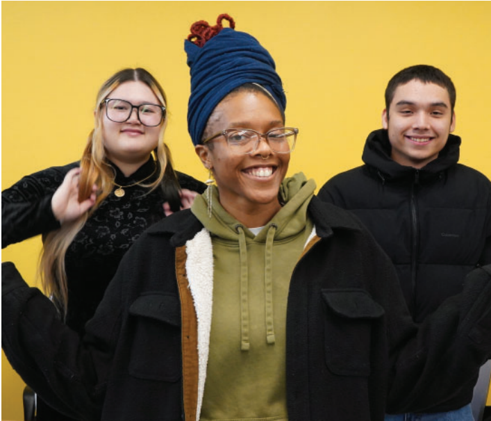
EVC hosted its bi-annual Club Rush with nearly 20 clubs.