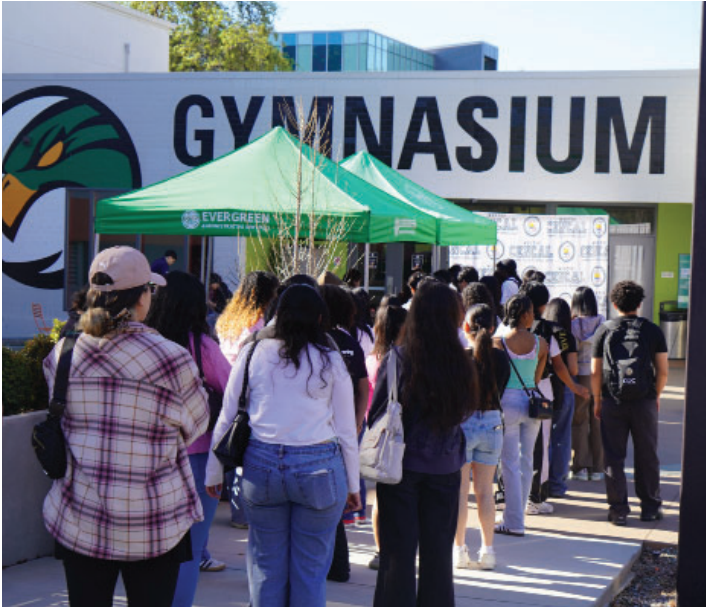
An all-day TRiO CenCal Student Leadership Conference brought together 17 different TRiO programs across the state to EVC in late February.