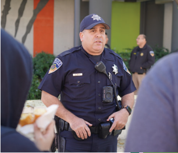
District Police in their bi-annual tradition hosted "Coffee with a Cop," one way they continue to engage with the EVC community.