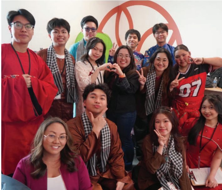
For two decades, EVC has celebrated the Lunar New Year with a campus ceremony.